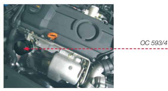
Figure 1: Installation position: view of the engine from above

This oil filter with integrated anti-drain back mechanism is being fitted in various models and brands of the VW Group (1.2 L and 1.4 L TSI gasoline engines). It is located on the generator bracket and is screwed on to the flange upside down.