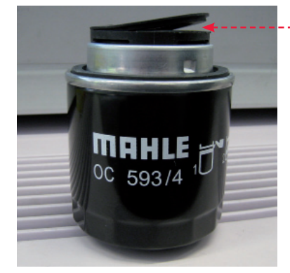
Figure 4: MAHLE OC 593/4

When removing the used oil filter, please ensure that the old gasket is removed too. Experience has shown that there have been instances where the old gasket remained on the flange unnoticed and two gaskets were fitted on top of each other when the new oil filter was fitted. The consequences: the valve no longer opens fully or the filter leaks.